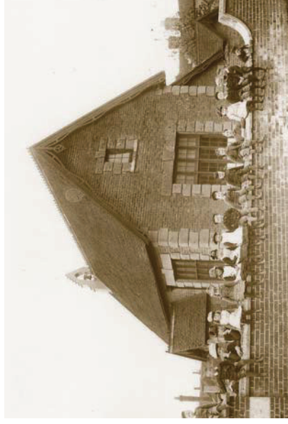
Petworth Infants School 1885 (on the site of the present Public Library)